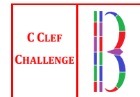
Gameboards are located in a sub file in CHARTS.