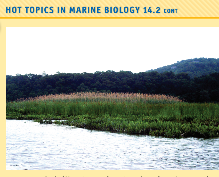
BOX FIG. 14.4 Patch of Phragmites australis growing and spreading at the expense of surrounding cattail vegetation in a tidal freshwater salt marsh in the Hudson River estuary.

Why has this genetic type so successfully displaced all of the native haplotypes across an entire continent? This is not clear as yet, but some features of the type M haplotype provide clues. First, this invasive genotype can have explosive growth from seed in a single growing season. It also responds much more to nutrient enrichment. Type M haplotypes outgrew native genotypes, produced more stems, and ultimately had 3–4 times more biomass. Salt marshes are now commonly near sources of nutrients, owing to human development. It is not clear, however, that this is a sufficient explanation for the wide spread of this haplotype. It may simply be