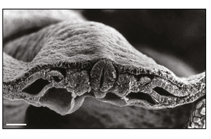
Fig. S3.2 Section through chick embryo showing somites, neural tube, and notochord. Upper panel: Scanning electron micrograph. Blocks of somites can be seen adjacent to the neural tube, with the notochord lying beneath it. The lateral plate mesoderm flanks the somites and has become divided into two layers by the formation of the coelom. Lower panel: interpretative diagram indicating the structures in panel above. Scale bar = 0.1 mm.